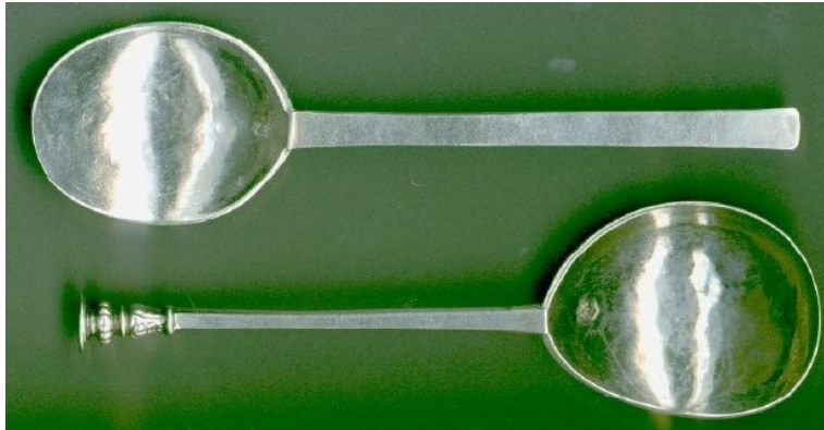
Figure 3: Puritan and Fig-shaped Bowls.

Note: Distinguishing between Egg- and Fig-shaped bowls can be confusing. For Egg-shaped bowl, the handle attachment is at the wide end of the bowl, whereas Fig-shaped bowls are attached at the narrow end.