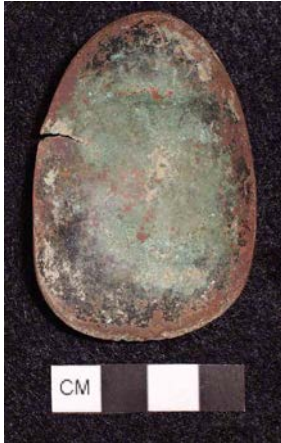
Figure 2: Egg-shaped Bowl