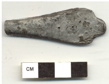
Figure 5: Trifid

“ Round-end Hndl ”: Round end handles have simple rounded ends