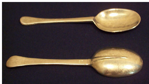
Figure 6: Rat Tail Spoon

A Spoon Rat Tail is a metal “spinal rib” on the back of a spoon bowl that reinforced the connection between the bowl and the stem (Figure 1). Seen in silver and latten spoons, the rat tail is most often associated with an egg-shaped bowl. The single or double metal “scale” at the junction of the bowl and the stem replaced the rat tail by the 1740s (see Hume 1991:181-183.)