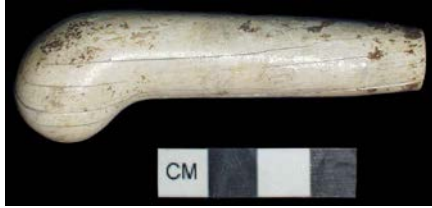
Figure 4: Pistol Grip